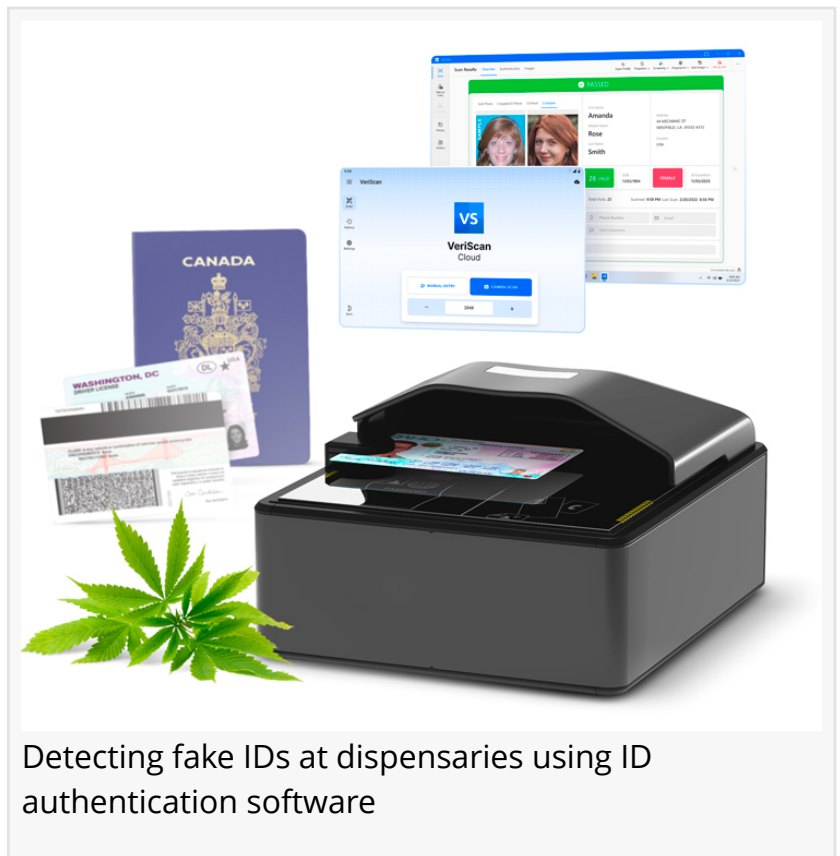
Detecting fake IDs at dispensaries using ID authentication software

This press release can be viewed online at: https://www.einpresswire.com/article/623989011