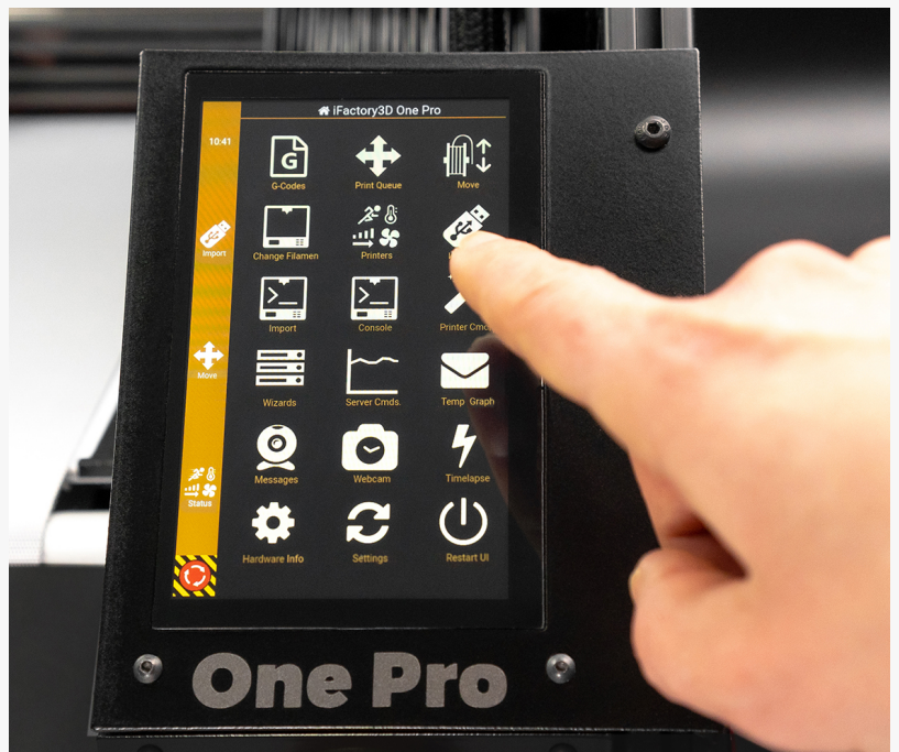
The One Pro enables series production, endless objects in length and complex structures in a material-saving way