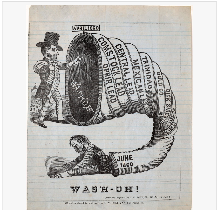
An 1860 illustrated "Wash-Oh!" lettersheet (lot 4205) with a spectacular cartoon highlighting the dangers of mining stock speculation (est. $3,000-$6,000).

The auction will also showcase a major new offering: rare printers' plates from the American Bank Note Company, plus other engravers. These plates were used for currency as well as stocks and bonds, and have been lotted in both the Stock and Currency sections of the catalog. The collection has never come to market before and should