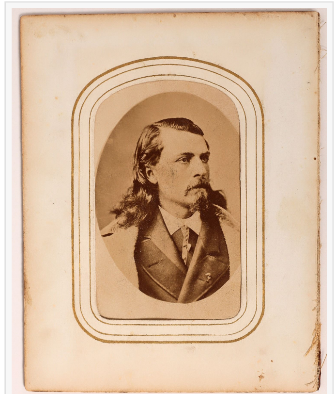
Carte de visite of Buffalo Bill Cody, made by the Theatrical Photography Co., depicting Buffalo Bill in his younger years, circa 1870s, in a nice 4 inch by 5 inch frame (est. $20,000-$50,000).