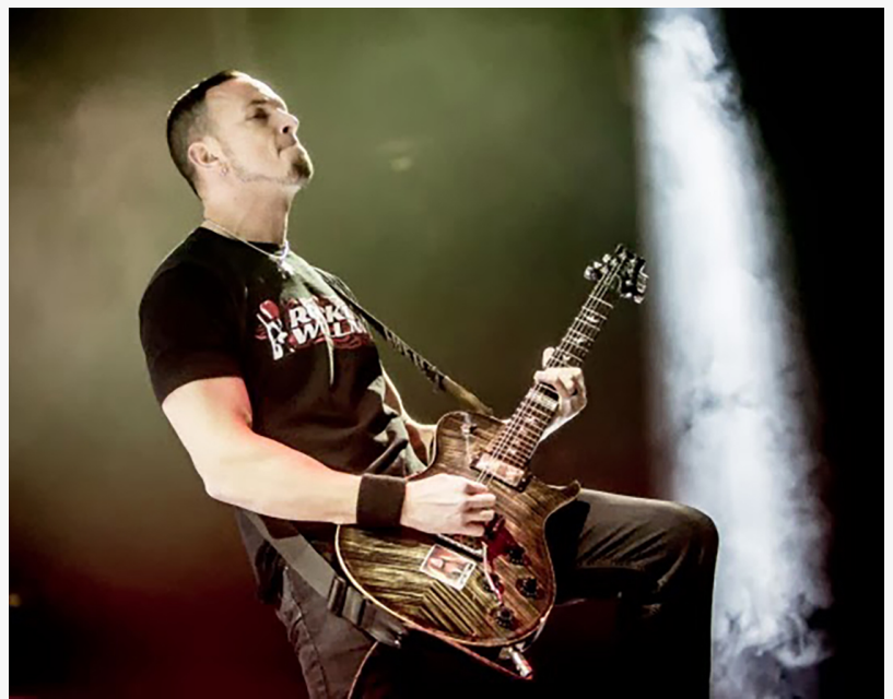
Grammy Winning Guitarist, Mark Tremonti of the bands Creed & Alter Bridge on stage at a concert in Milan, Italy

This press release can be viewed online at: https://www.einpresswire.com/article/624176739