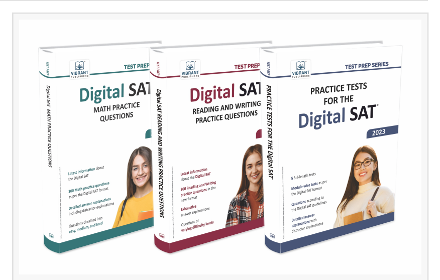
Vibrant Publishers is one of the first publishers to come out with practice resources for the Digital SAT.

BROOMFIELD, CO, UNITED STATES, March 28, 2023 /EINPresswire.com/ -- Vibrant Publishers is extremely thrilled to be a pioneer in bringing out updated and relevant practice questions for students appearing for the digital SAT starting from 2023. Vibrant has launched three books namely <u>Digital SAT® Reading and Writing Practice</u> Questions, <u>Digital SAT® Math Practice</u> Questions, and <u>Practice Tests For The Digital SAT®</u> in March 2023.