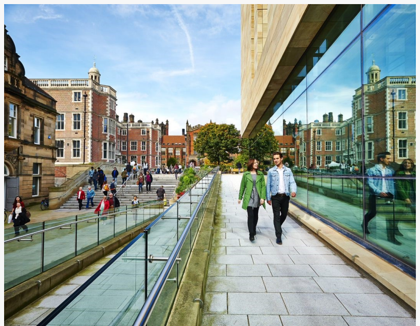
Newcastle University - a World Top 125 in the best UK student city.

With 180+ years of impactful education and research, the Russell Group institution has one of the best graduate employability records. It is one of the top 20 'most targeted' UK universities by the Times Top 100 employers.