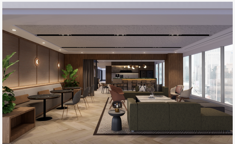
JustCo Sydney - 135 King Street Interior