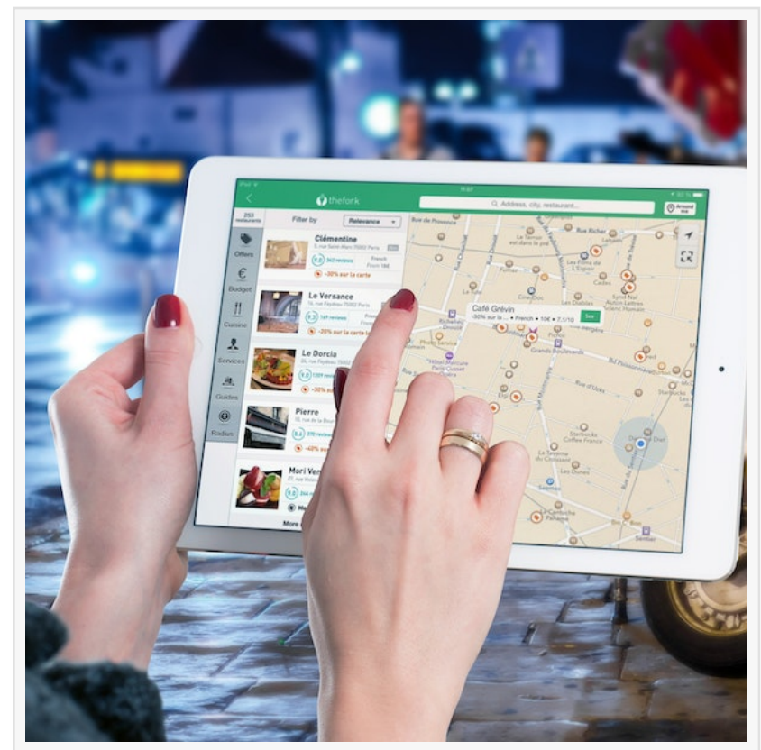
ChatGPT AI for WordPress Websites

With the launch of the ChatGPT service, the agency is providing businesses with a powerful tool to enhance their customer engagement and streamline their communication processes.