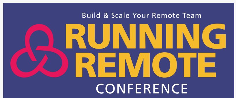
Running Remote Logo