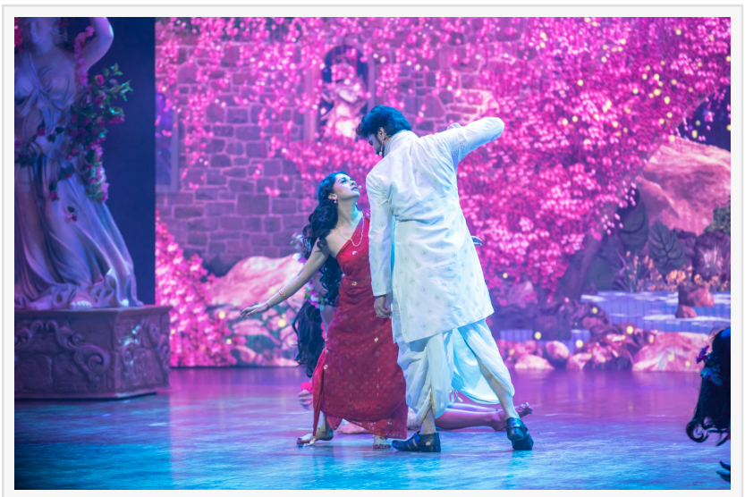
Devdas - The Musical brings one of the most famous love sagas in Indian literature to life on stage