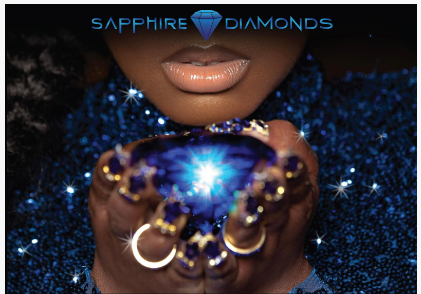
Sapphire Diamonds Collection