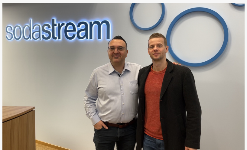
Timly and SodaStream announce innovation for inventory management software

ZÜRICH, ZH, SWITZERLAND, March 29, 2023 /EINPresswire.com/ -- Every company is familiar with the annual inventory effort, which often takes up a lot of time and human resources. Since more and more companies also employ home office workers, another problem has been added: The IT devices that home office employees have at home can only be recorded for inventory with great difficulty and often unreliably.