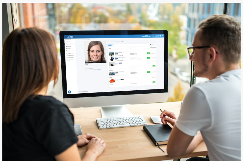
Timly inventory management software for better asset tracking