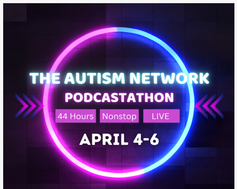
The Autism Network Podcastathon 44 hours Live Non Stop April 4-6 www.autismnetwork.com

Dr. Temple Grandin, the famed international speaker and author of many bestselling books as