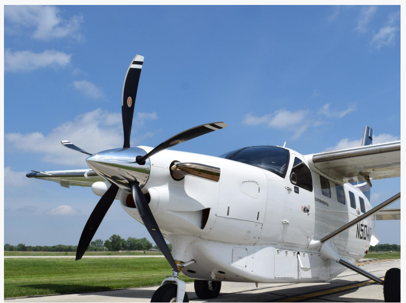
Daher Kodiak 100 with new five-blade composite Hartzell prop.