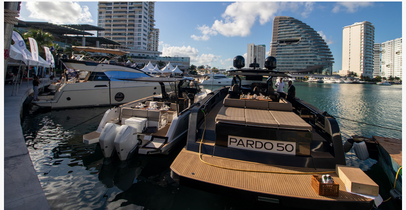
The Pardo Pavilion drew a constant flow of visitors

As possibly Cancun's most glitzy event it will once again be complete with fashion shows debuting exotic swimsuits and tropical wear, top jewelry designers like Aha from Columbia, and luxury oceanfront realtors alongside yachts on display. The best seat in the house is from the red-carpet luxury tent with gourmet food samplings from Casa Rolandi and top shelf open bar. The boat show has become a meeting place for Mexico's well-off. It's definitely a place to be and be seen in the beautiful upscale neighborhood of Puerto