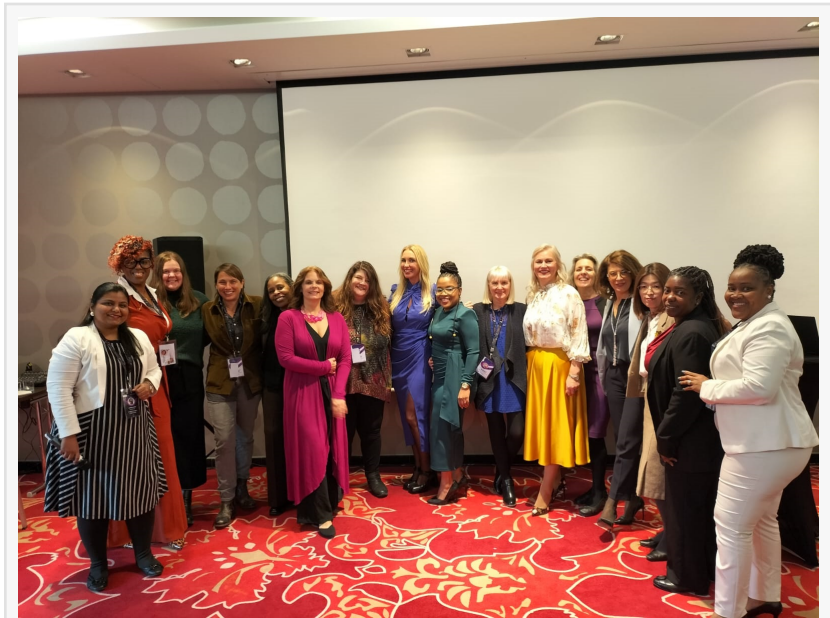
World Women Forum 2023 Paris, France hosted by Star-Icon Conferences. Global speaking tour uniting 70+ inspirational game changing thought leaders.