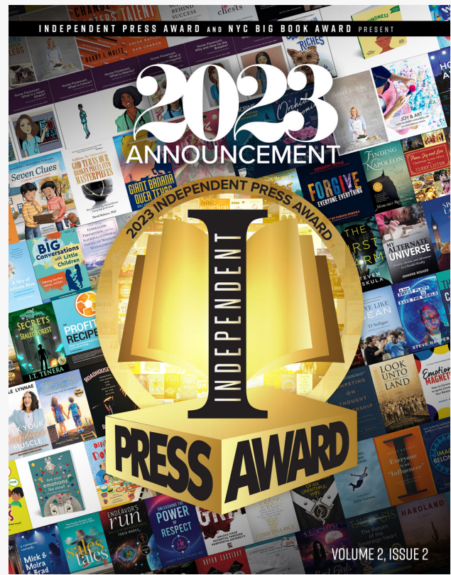
2023 IPA Announcements