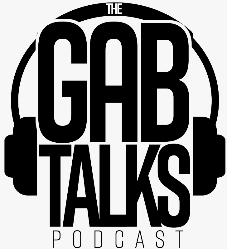
The GAB TALKS podcast