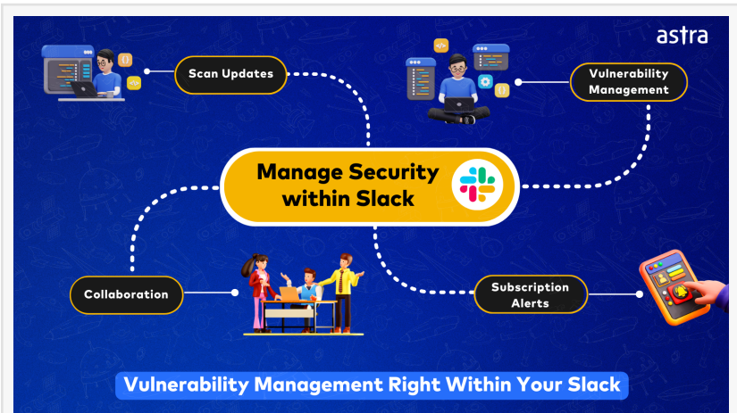
Vulnerability Management within Slack