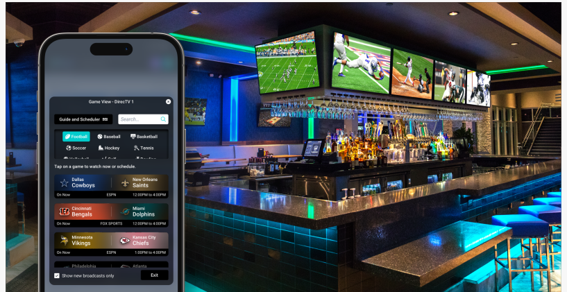
SAVI 3.3 Game View