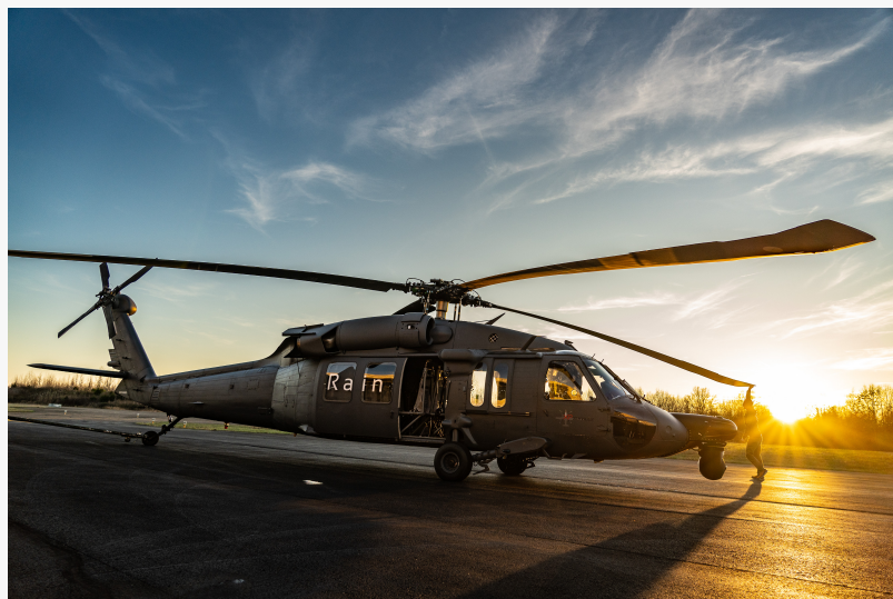
A Black Hawk helicopter in Tennessee rolling back to its hangar after being successfully commanded remotely from a command center in Alameda, CA.