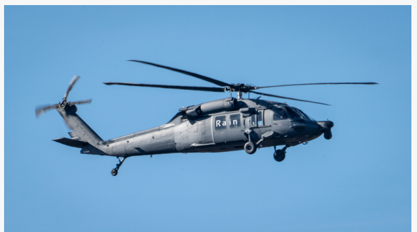
A UH-60 Black Hawk equipped with the Rain Aircraft Integration Kit flies a remotely commanded flight plan.

/EINPresswire.com/ -- Rain Industries, a leader in automated rapid initial wildfire suppression, has added the Sikorsky UH-60 Black Hawk to its list of supported aircraft, demonstrating the ability to remotely command the aircraft via satellite link from a central command center. This milestone event showcases early steps towards a network of automated aircraft capable of rapidly responding to ignitions to prevent catastrophic wildfires.