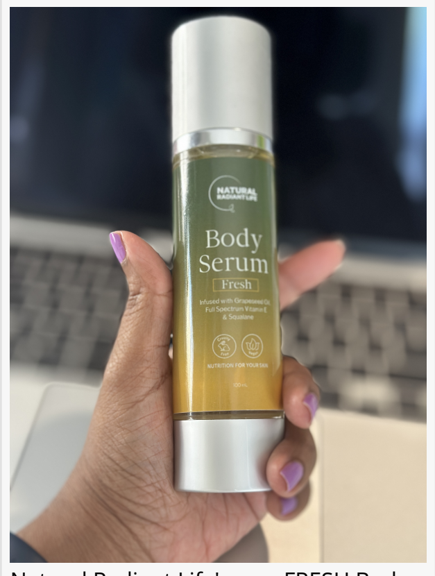
Natural Radiant Life's new FRESH Body Serum

Both products are free of synthetic fragrances, parabens, sulfates, and other harmful chemicals, yet include Vitamin E and squalene. The body butter is made with shea butter, cocoa butter, grapefruit and lime essential oils—effective in sealing in moisture and providing healthy glowing skin. The Body Serum is made with grapeseed oil, which is rich in antioxidants and known for penetrating the skin quickly.