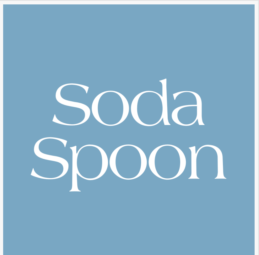
soda spoon marketing agency logo

SALT LAKE CITY, UTAH, UNITED STATES, March 29, 2023 /EINPresswire.com/ -- Soda Spoon Marketing Agency, based in Salt Lake City, has been named the top-ranking SEMrush certified agency partner in Utah for 2023. This is a significant achievement for the agency, which has established itself as a leading provider of full-service digital marketing services to businesses across the state. The recognition by SEMrush is a testament to the hard work and dedication of the agency's team in delivering exceptional results for their clients.