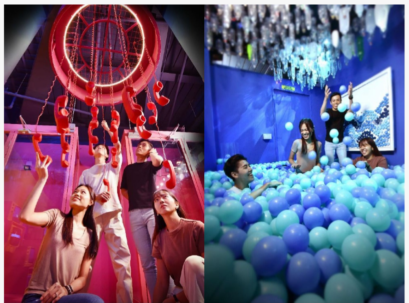
Players in Museum of Humankind.

Finally, in ‘Dr. X,’ players must rescue a friend from Dr. X., a misguided and failed academic. In his research laboratory, he tests how extreme fear influences the human brain using unsuspecting