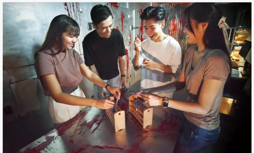
Players working together in Dr. X.