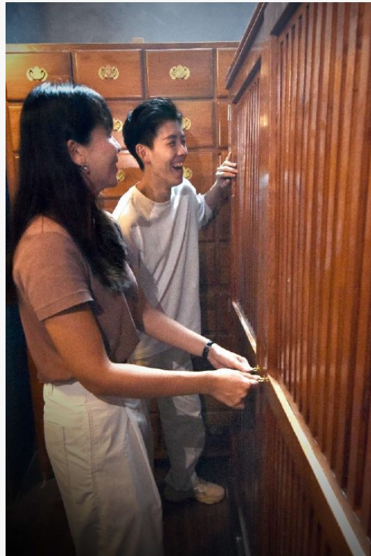
Players working together in Shangri-La.

The Centre and its partners have played a pivotal role in transforming the way students and the