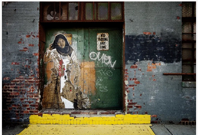
Artwork by Street artist Swoon