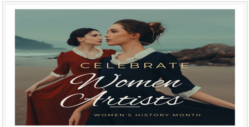
Celebrating Underground Women Artists