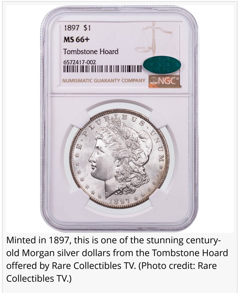
Minted in 1897, this is one of the stunning century-old Morgan silver dollars from the Tombstone Hoard offered by Rare Collectibles TV.

A type of coin popular with collectors for generations, Morgan silver dollars are named after their designer, United States Mint engraver George T. Morgan, and were minted from 1878 to