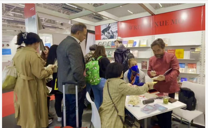
Bustling book signing scene at 2023 Frankfurt Book Fair

As an influential book author in contemporary Chinese literature, Xue Mo has been shortlisted three times for the Mao Dun literature Award, and created dozens of full-length novels, including The Desert Trilogy ( Desert Rites , Desert Hunters , White Tiger Pass ), The Soul Trilogy ( Curse of Xixia , Legendary Wolf of Xixia , The Holy Monk and the Spirit Woman ), Wild Fox Ridge , Liangzhou