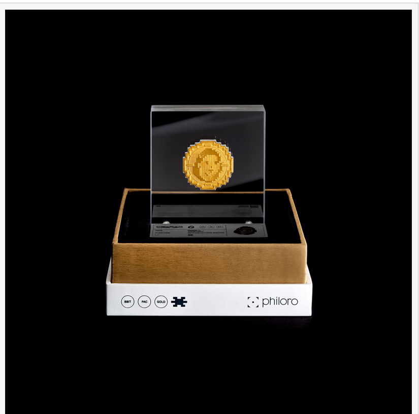
Pack Shot Crypto Vreneli

The artistic design of the Crypto Vrenelis challenges traditional gender roles and presents contemporary Vrenelis – based on the style of the renowned CryptoPunks. This feature not only makes Crypto Vrenelis an intriguing investment opportunity, but also appeals to collectors with an affinity for art. The mission of the Crypto Vrenelis is to address a social phenomenon: The question "Who or what am I?" is answered fluidly in large parts of society. Definitions are passé. The Crypto Vrenelis reflect this freedom and the play of fluid identities in society.