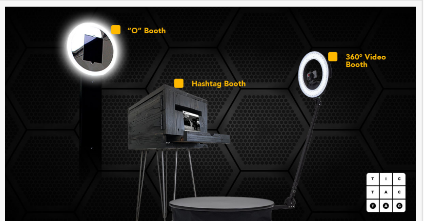
Lead Generating Photo Booths

This press release can be viewed online at: https://www.einpresswire.com/article/625198683