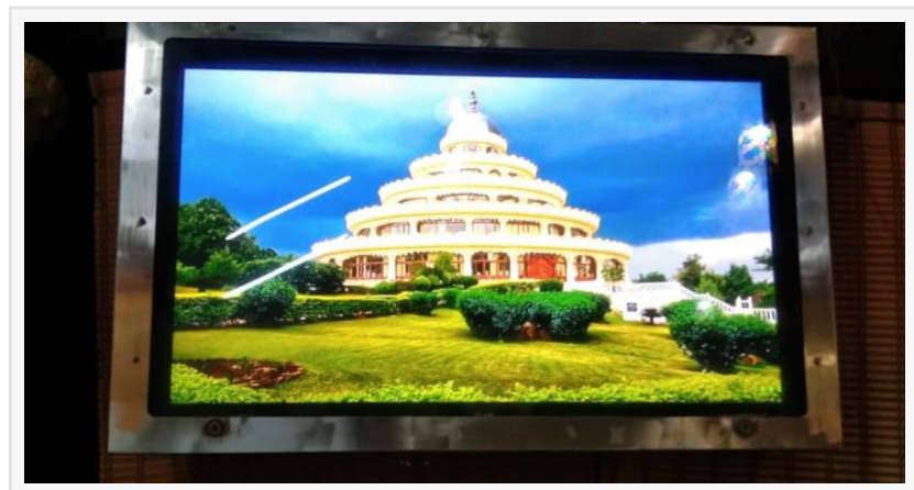
A digital signage screen showing the Art of Living Vishalakshi Mantap, the central attraction

NEW YORK CITY, UNITED STATES, March 31, 2023 /EINPresswire.com/ -- Located 21 km south of the bustling IT town of India, the Art of Living's international headquarters in Bangalore has been about creating a harmonious space that encourages spiritual growth and self-discovery.