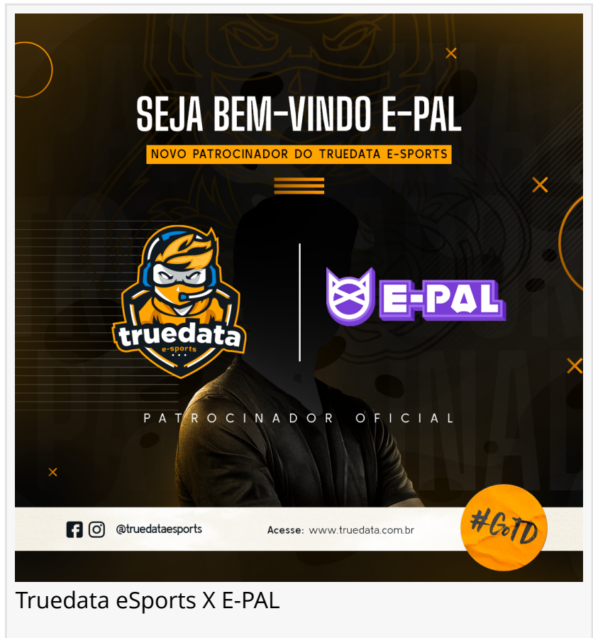
Truedata eSports X E-PAL

IRVINE, CALIFORNIA, UNITED STATES, April 3, 2023 /EINPresswire.com/ -- E-PAL (EPAL.GG), a social platform for gamers to make friends worldwide through playing video games, has partnered with Truedata's eSports Division, a leading video production company backed by a computer sales firm in Brazil. Truedata's eSports Division is the largest eSports team in the Amazonian region, made up of professionals in Free Fire eSports who are selected through specific tests for Battle Royales. The team consists of 35 eSports players who are committed to improving their skills, and the organization has won over 50 national championships.