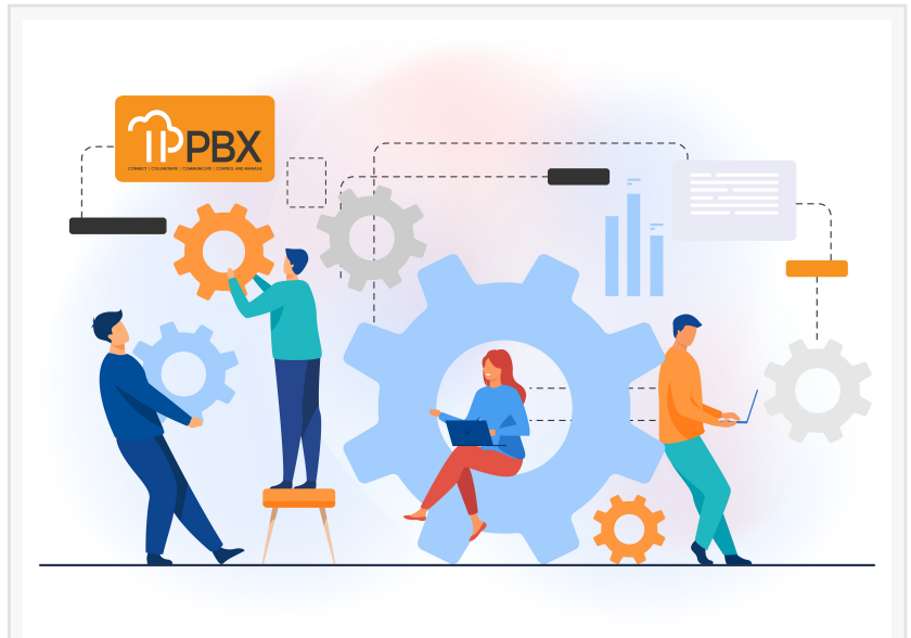
The Power of Integration

One of the main advantages of IPPBX is its ability to consolidate several essential business modules into a single platform, reducing the need for external applications and integrators like