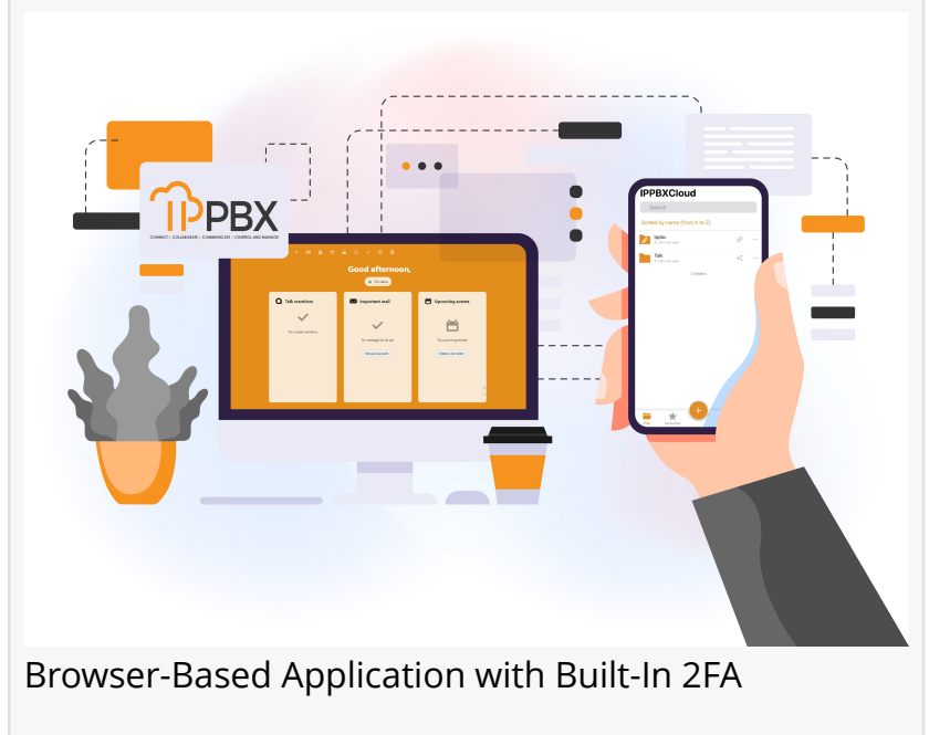
Browser-Based Application with Built-In 2FA