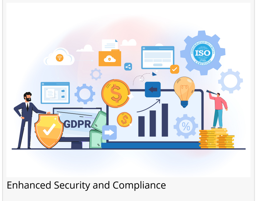
Enhanced Security and Compliance