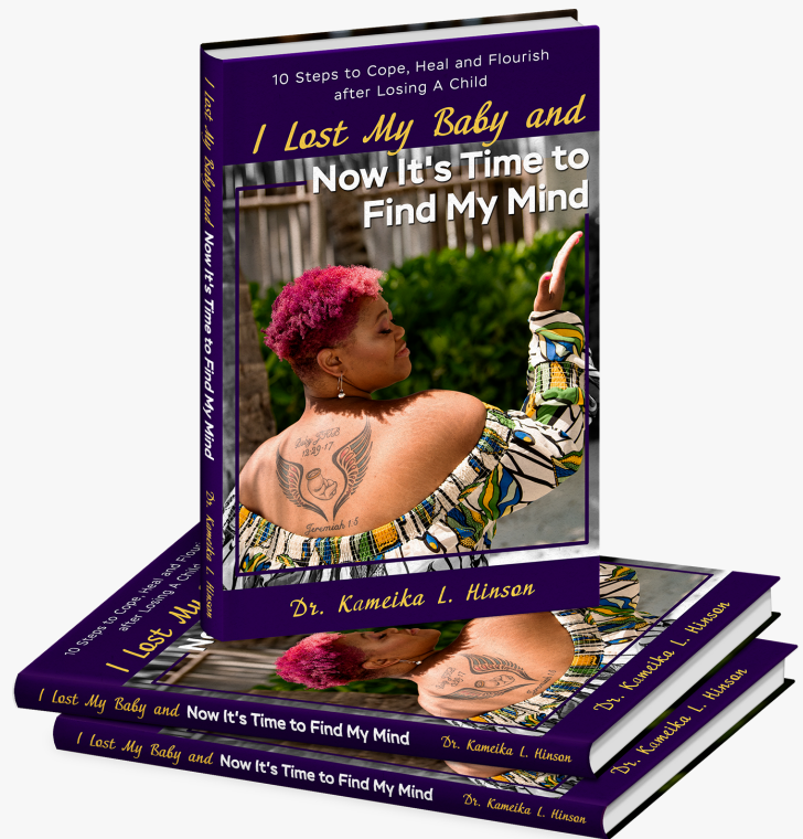
I Lost My Baby and Now Its Time To Find My Mind

This press release can be viewed online at: https://www.einpresswire.com/article/625671875