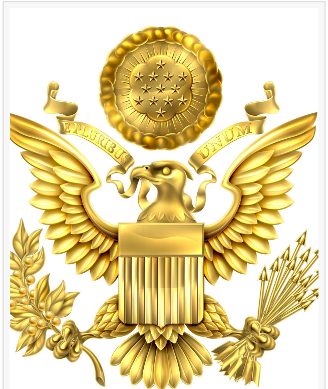
James M Maisel, M.D., Recipient Special Congressional Award

SYFOVRE is the first FDA approved pharmacologic treatment option for dry macular degeneration. 1-4 It contains a unique Complement Inhibitor designed to protect the macula from damage caused by inflammation. SYFOVRE is an eye specific medication that helps regulate an overactivated part of the immune system in your eye. This overactivation can contribute to the progression of macular degeneration to geographic atrophy (GA). Clinical studies have shown that once a month or every other month treatments with SYFOVRE can help reduce the risk of vision loss and maintain fine visual function in patients with dry macular degeneration allowing them to read and drive longer. Symptoms of all macular problems may include missing, wavy or distorted central vision with difficulty reading an entire word and are often evident when looking at an Amsler grid. Patients with "wet" macular degeneration often also have "dry" macular degeneration and may need treatment for both problems.