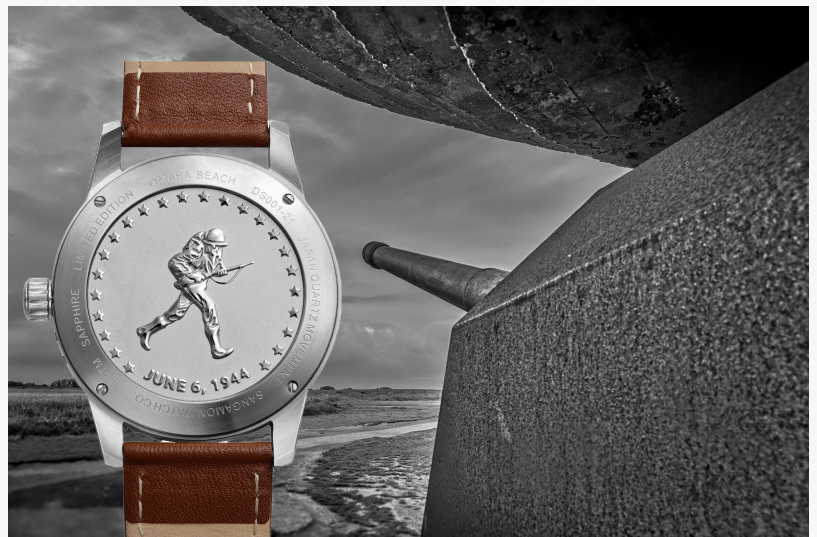
Omaha Beach Collection by Sangamon Watch Company