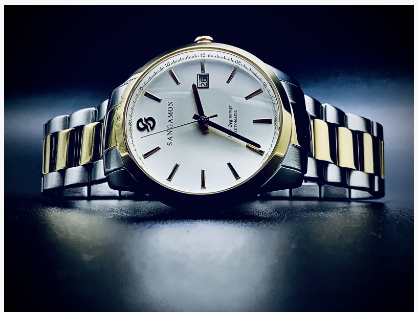
Lincoln's River Watch by Sangamon Watch Company

Since its opening in October 2021, Sangamon Watches has experienced tremendous business success and has welcomed countless visitors from all corners of the globe. Travelers along Route 66 visit this fantastic shop, admiring the beautiful watches, friendly staff, and wide variety of Route 66 souvenirs. Local TV and radio media have further exposed the world to the shop's unique and authentic products and services.