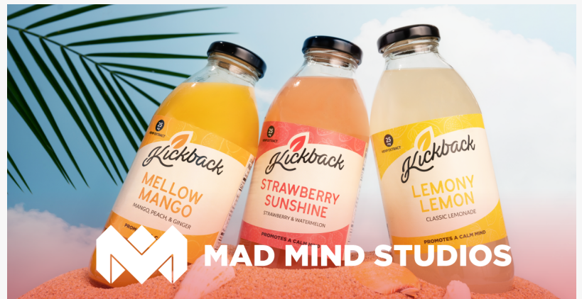
Web Design Los Angeles Agency