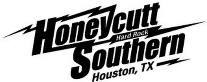
Honeycutt Southern - Houston Texas - Hard Rock

The band is excited to share their new single with the world and looks forward to seeing how it resonates with their fans. Ain't That a Bitch will be available on all major streaming platforms on April 14th.