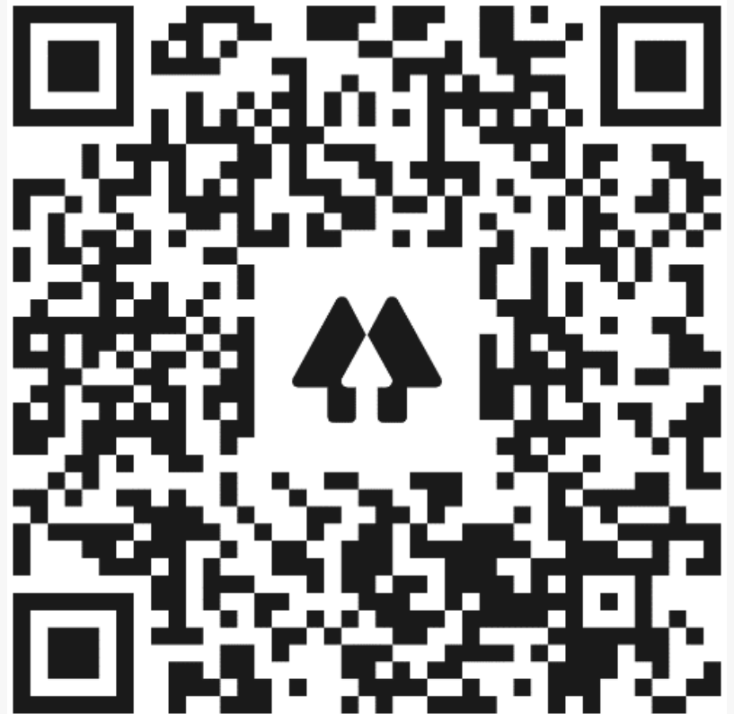
Link Tree for The Autism Network