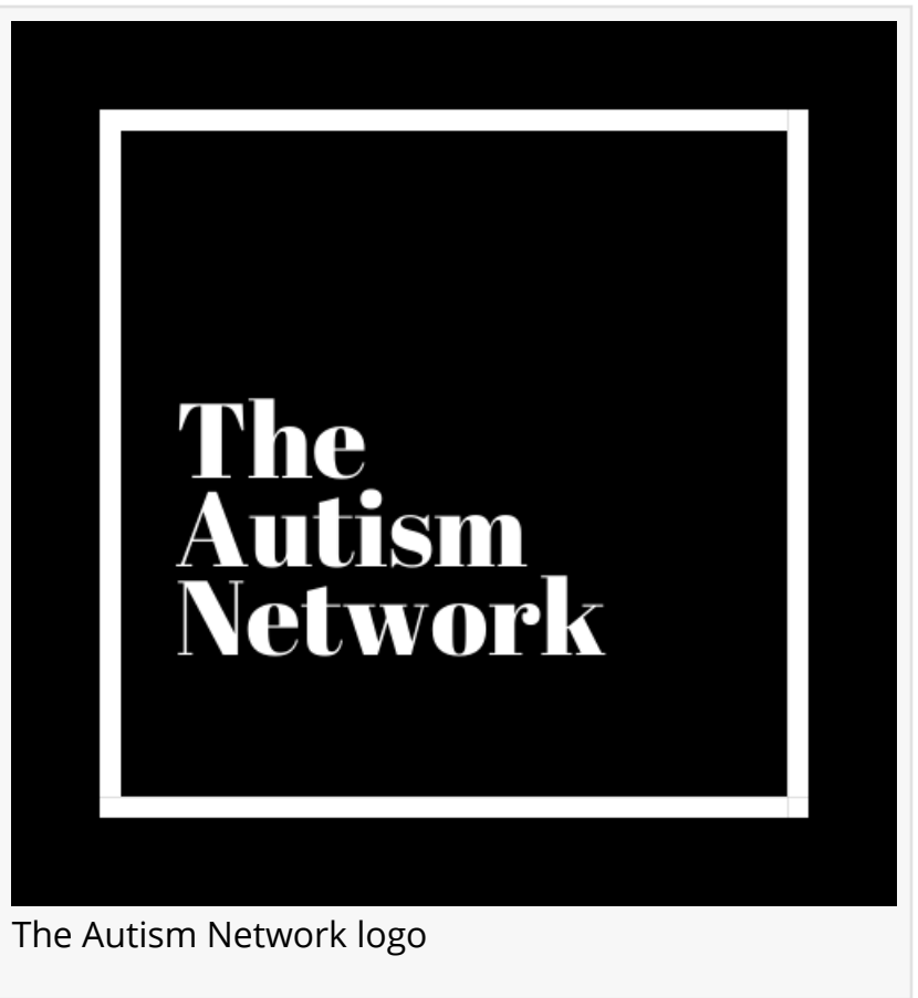
The Autism Network logo