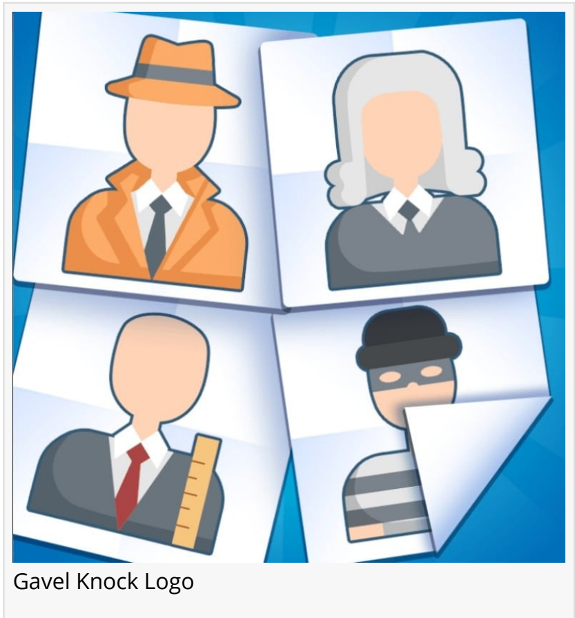
Gavel Knock Logo

Maysalward's commitment to creating games inspired by cultures has led to the development of original mobile games that are both entertaining and educational. The company believes that sharing its cultural heritage through games can help build bridges between different communities and promote a better understanding of diverse cultures.