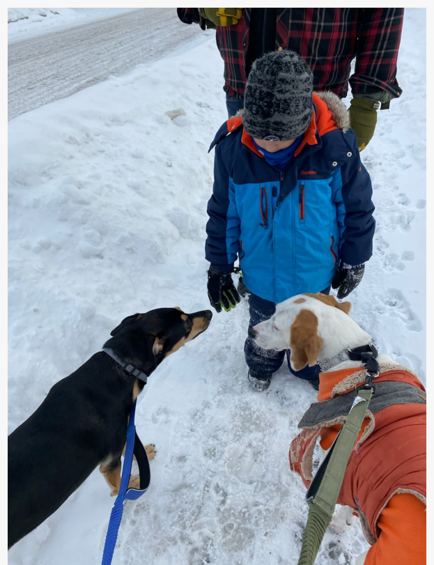
Dogs love being around other pets

This press release can be viewed online at: https://www.einpresswire.com/article/626023957