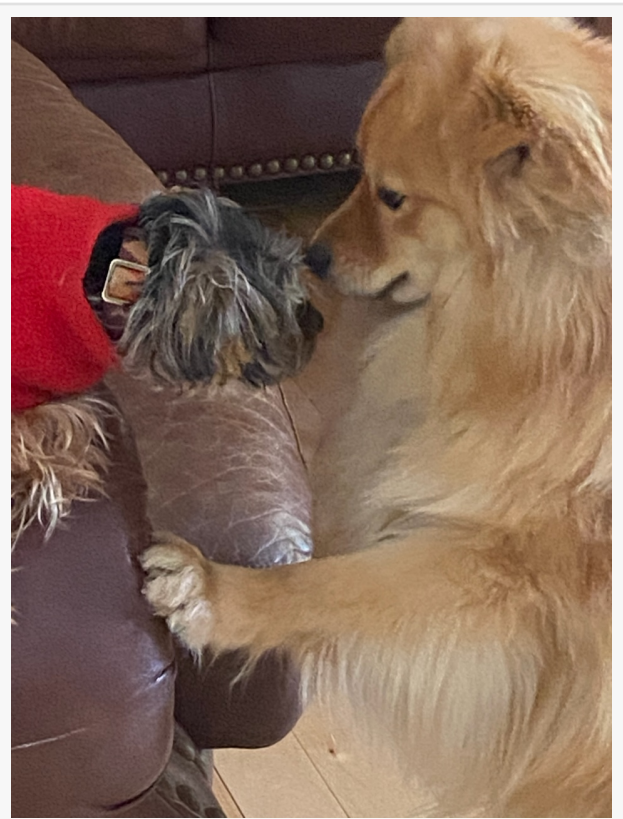
Pets crave friendship, companionship and the adventure a furry best friend brings