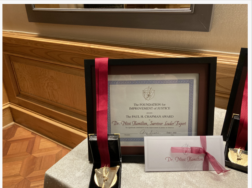
Paul H. Chapman Award

Shawn O'Connor Foundation for Improvement of Justice +1 770-831-9411 executivedirector@justiceawards.com Visit us on social media: