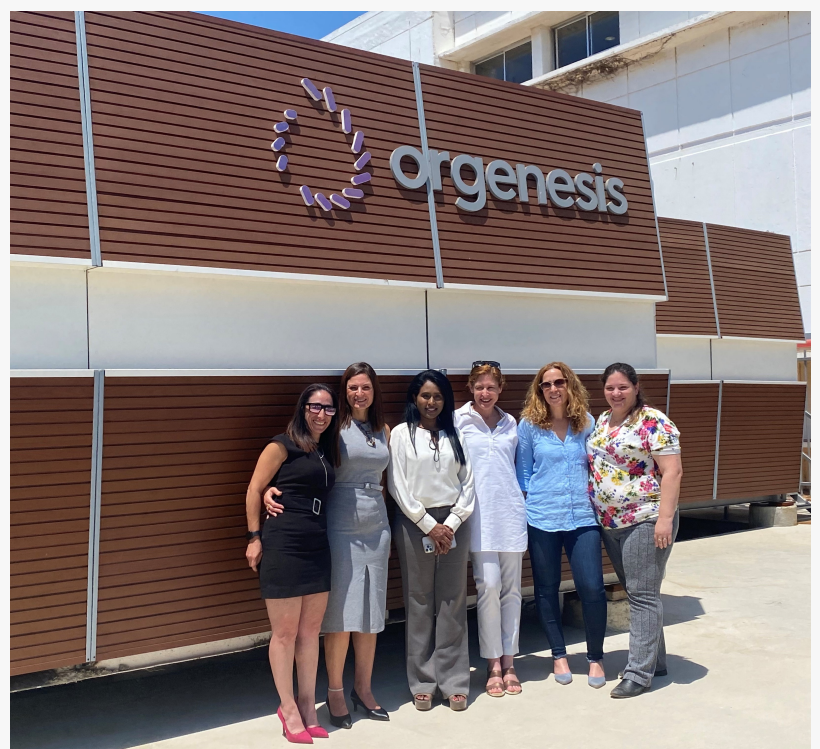
$ORGS Team Lab

The goal of the MOU is to progress towards a wider definitive agreement pursuant to which the University and ORGS POC CA expect to roll out Morgenesi's proprietary Orgenesi Mobile Processing Units and Labs™ ("OMPULS™") throughout universities within the State of California.