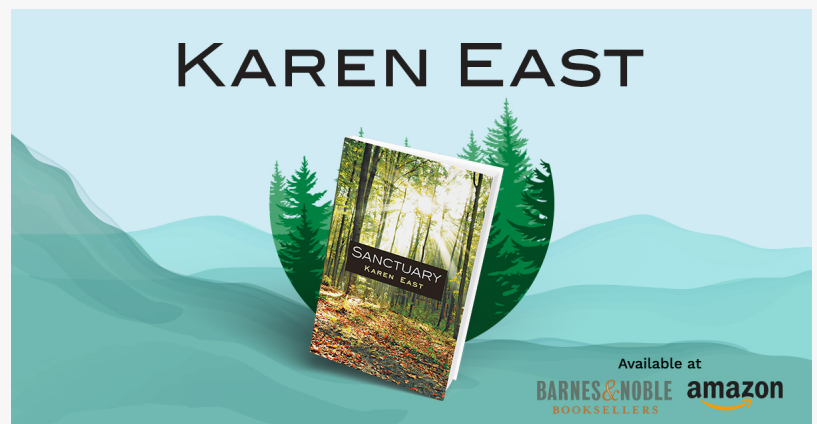
Sanctuary by Karen East

This press release can be viewed online at: https://www.einpresswire.com/article/626215481