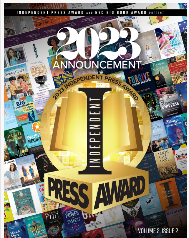
2023 IPA Announcements