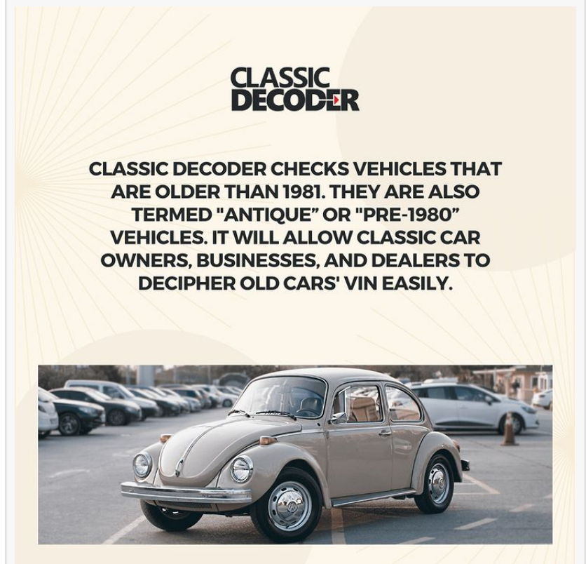
Classic Car VIN Decoder