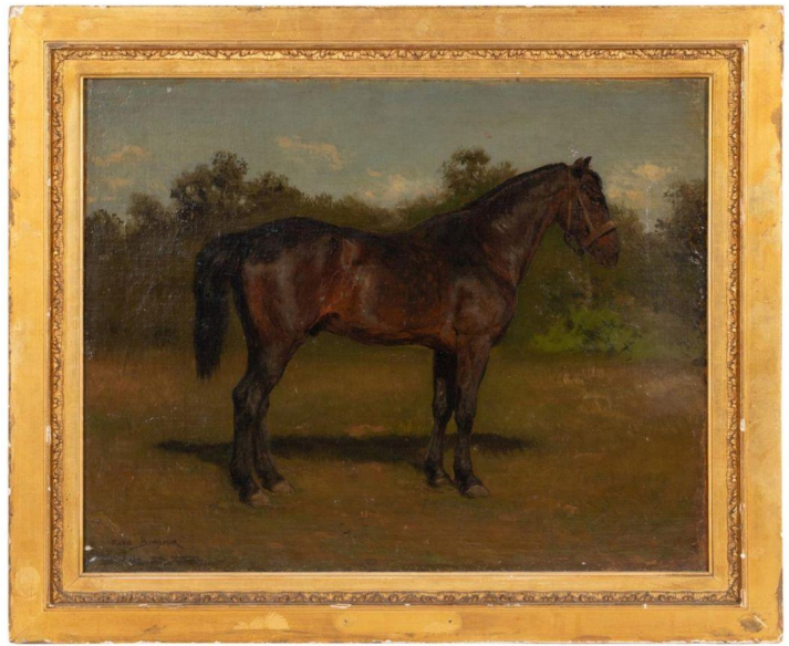
Lovely undated oil on canvas by Rosa Bonheur (French, 1822-1899), titled Study of a Brown Bay Horse, artist signed, 15 inches by 18 ¼ inches (sight, less frame). (est. $8,000-$12,000).