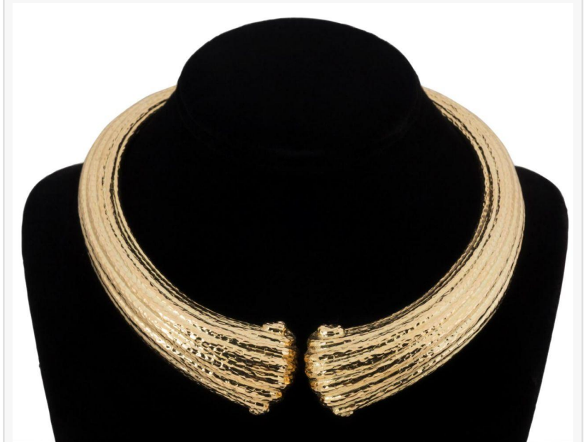
Italian 18kt yellow gold hinged collar necklace of ribbed form, with scrolling terminals and a hand-applied high polish finish, marked 750 Italy, weighing 213.2 grams (est. $10,000-$15,000).