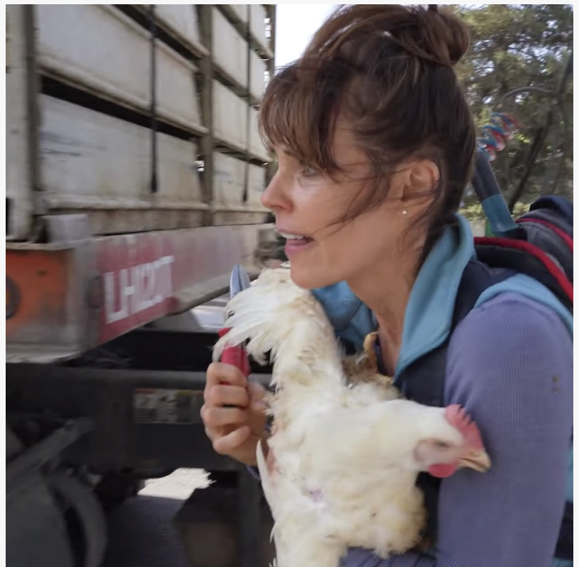
Actress/Activist Alexandra Paul with a chicken. She called it a rescue, not a theft.