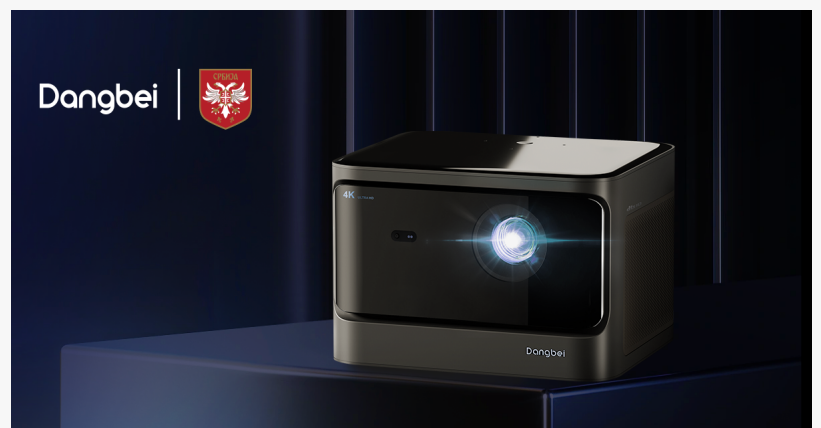
Dangbei Mars Pro 4K Projector

Dangbei specializes in designing and developing software matrix, operating systems, smart projectors, and more. The company's large-screen software