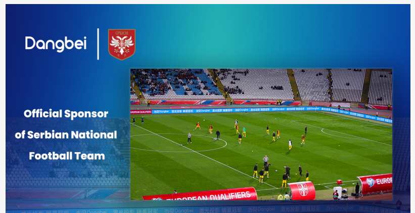
Dangbei Makes an Appearance at UEFA Euro 2024