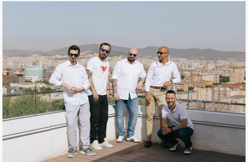
Moravio React Native Agency