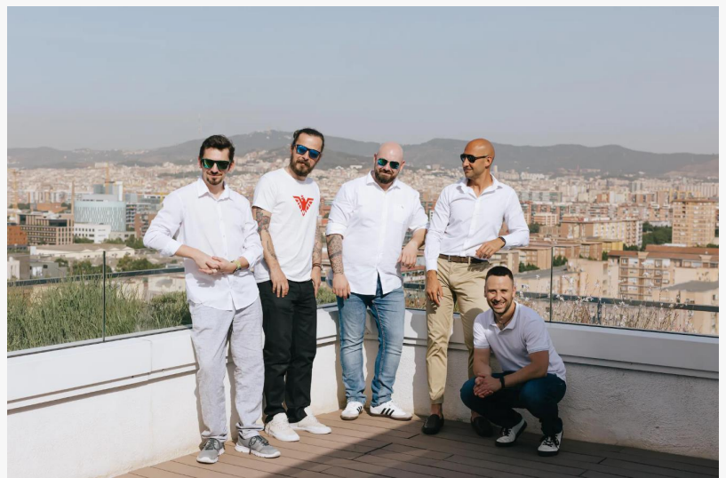
Moravio dedicated software development team

milliseconds to capture the attention of a browsing audience, businesses across the board are investing wisely in live streaming app development to match the preferences of internet users everywhere. Software is constantly being tasked to transition what were once human activities into the digital domain. Globalization, pandemic enforced lockdowns and other international disruptions to physical union, have all conspired in the creation of improved video streaming technologies.