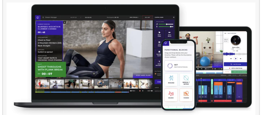
Live Streaming app development example

The introduction of bespoke video streaming app development company services is a response to customer demand for live-kitted apps that are fluent, user-engaging and futuristic. With only