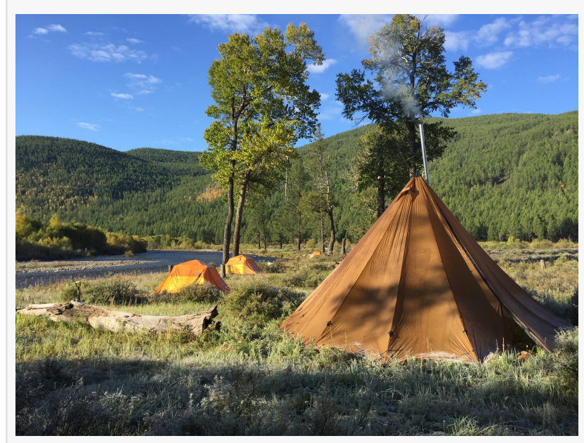
Camping along the Terelj river in the Gorkhi-Terelj National Park, Mongolia.

smaller, stouter and way tougher than any riding horse. An ancient symbol to a past era when horses were hunted wildlife, revered and painted on cave walls.