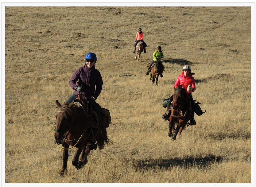
Cantering over the steppes in the Gorkhi-Terelj NP, Mongolia. Experienced easy to handle horses for novice to expert riders.

While visiting Mongolia, one of the protected areas to visit on a day trip, or for an overnight experience, is Hustai National Park, where herds of the true wild horse can be seen. The Przewalski horse, or the "Takhi" in the Mongolian language can be found a few hours outside of Ulaanbaatar. These are true wild animals and a throwback to before the horse was domesticated. They're